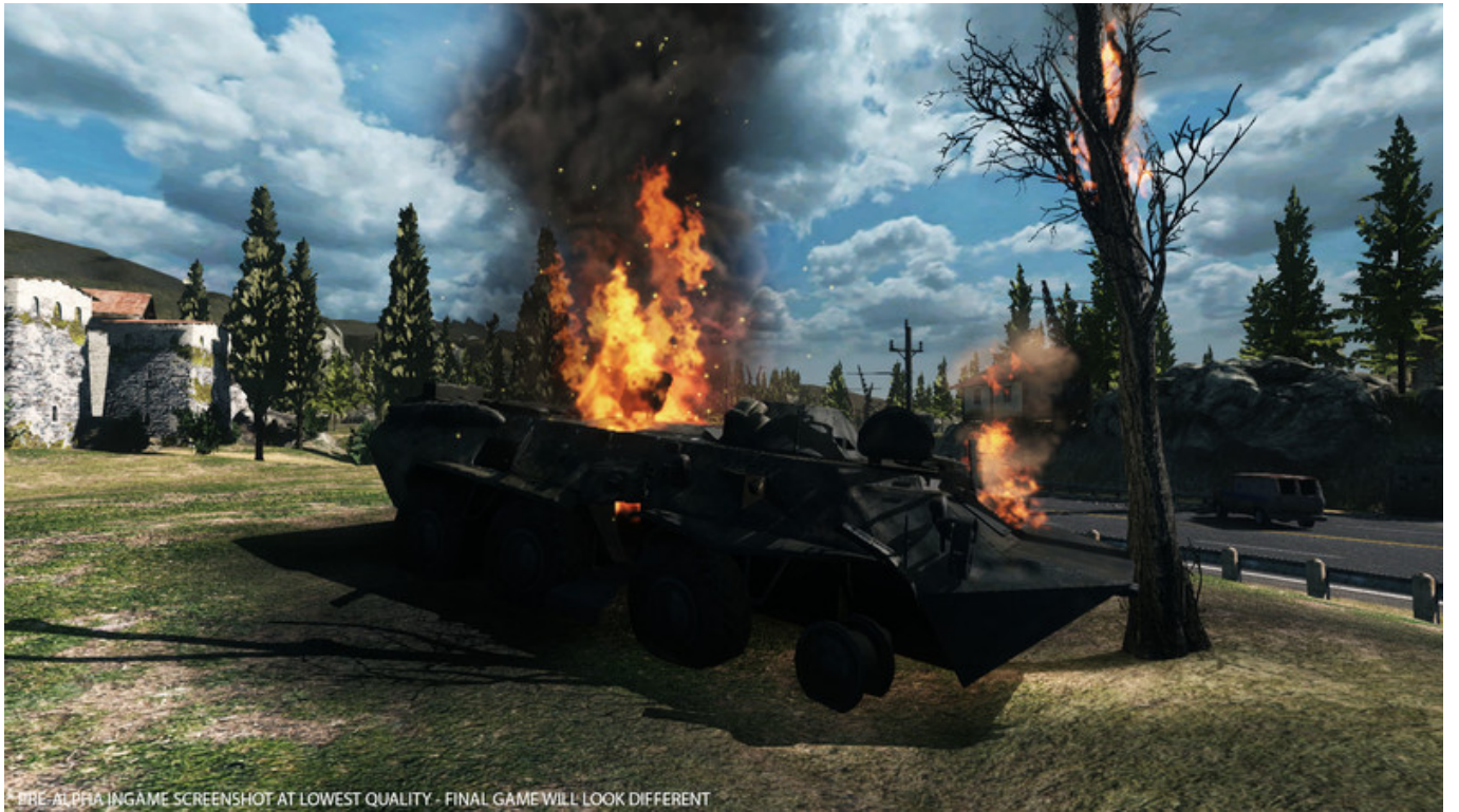
FIRE ALPHA IN GAME SCREENSHOT AT LOWEST QUALITY - FINAL GAME WILL LOOK DIFFERENT