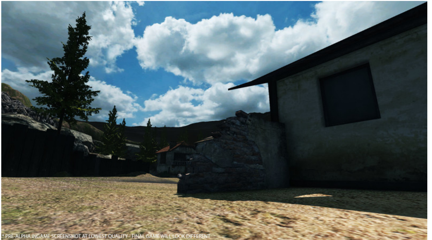
* PRE-ALPHA INGAME SCREENSHOT AT LOWEST QUALITY - FINAL GAME WILL LOOK DIFFERENT